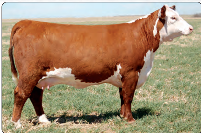
BR Anastasia 3023 ET — dam of Lot 88