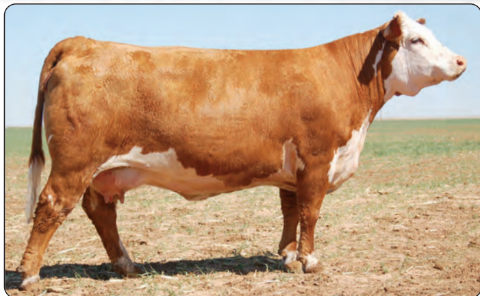
BR Abigail 8130 ET — dam of Lot 83