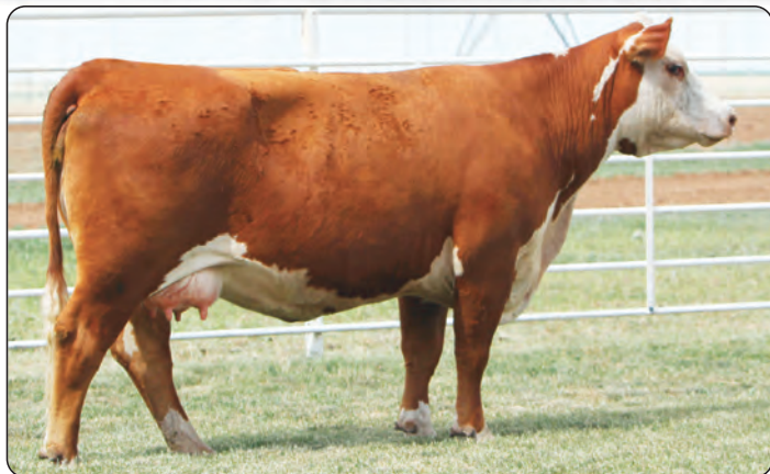
BR Carmen 4134 — dam of Lot 40