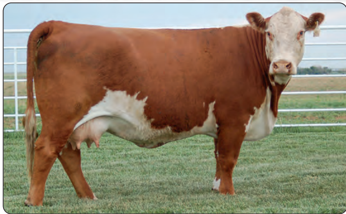
BR Terri 0036 ET — dam of Lot 37