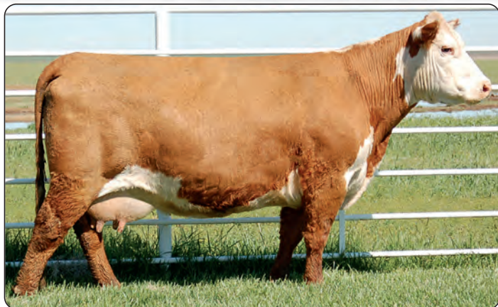
BR Ms Sooner 7172 — dam of Lots 86 & 87