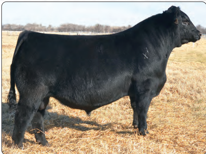
EXAR Denver 2002B — sire of Lots 212–217; grandsire of Lots 218–226