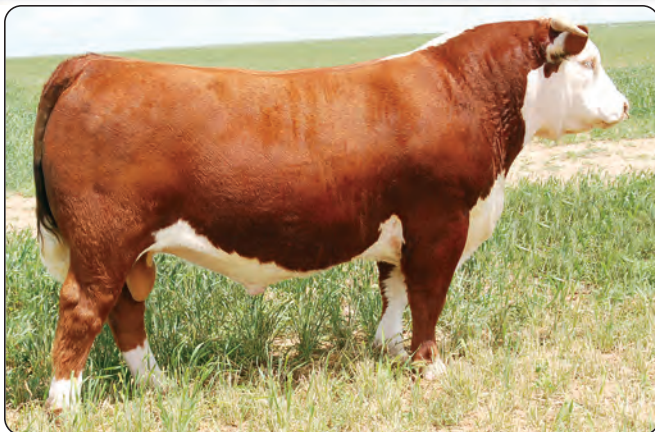
BR Nitro Aventus 3116 ET — sire of Lots 73–75