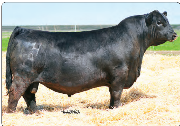
HA Cowboy Up 5405 — Sire of Lots 207–210

✓ Top 5% $W, top 5% BW, top 5% Milk, top 10% CED, top 10% CEM, top 25% SC.