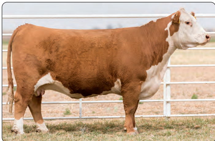
BR CSF Breezy 1076 ET — dam of Lots 32 & 105