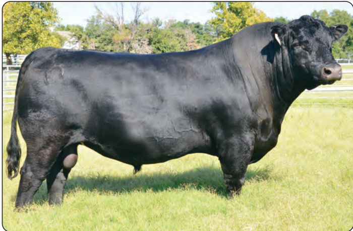
Sitz Top Game 561X — sire of Lot 230