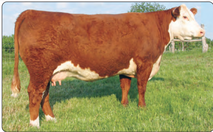
BR DM Geisha ET — maternal granddam of Lot 43