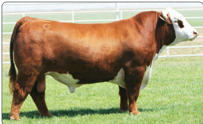
BR Belle Air 6011 — His sons and several paternal brothers sell