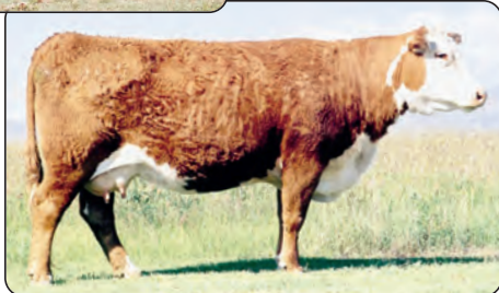
CL 1 Dominet 496 1ET — dam of Lot 44