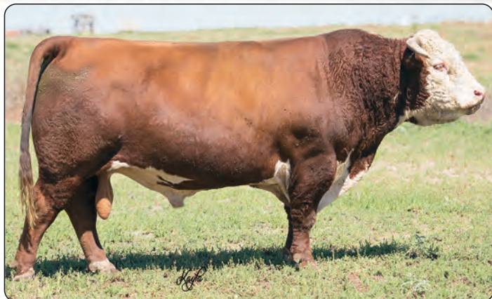
BR RA Copper 128Y — sire of Lots 63 & 64