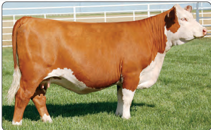
BR Audrey 4075 ET — dam of Lots 22 & 23