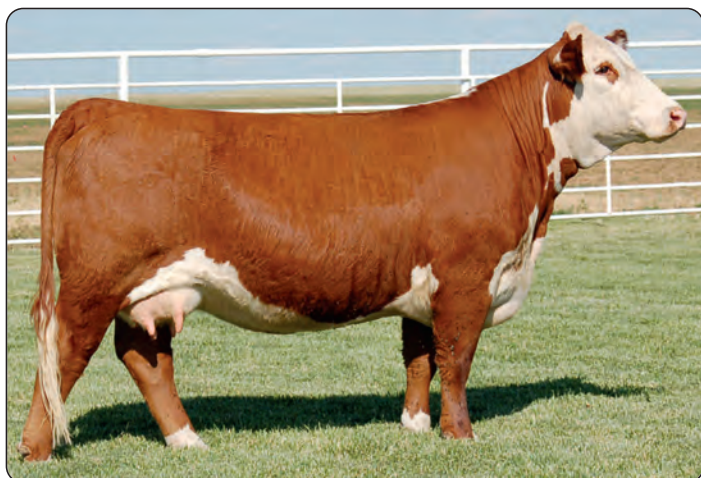
BR Veronica 5019 ET — dam of Lot 26