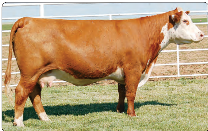
BR Madelynn 8017 ET — dam of Lot 64; granddam of Lot 63