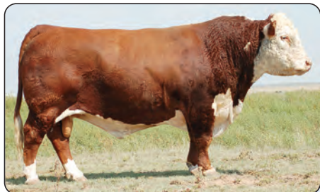
DM BR Sooner — sire of Lot 44