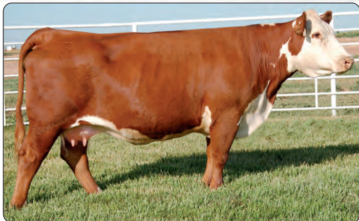
BR Zoey 8143 ET — dam of Lots 15, 16, 71