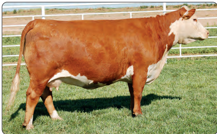
BR CSF Gabrielle 8051 ET — dam of Lots 11, 21, 82, 84, 98