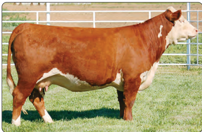
BR Gabrielle 3A09 ET — dam of Lot 59